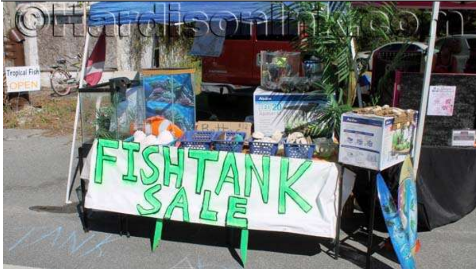
Among the many, many various articles for sale were items for tropical fish.