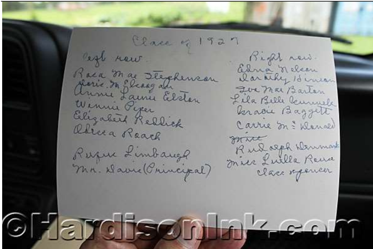
This is the back of the photograph, which shows the name of each person in order on the reverse side. It is in the handwriting of Iva Mae Barton (Mixson).